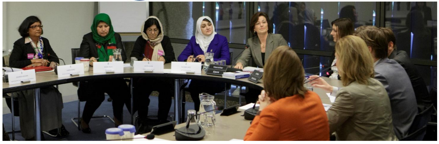
Dutch parliamentarians from Foreign Affairs Committee welcomed Afghan delegation of female leaders