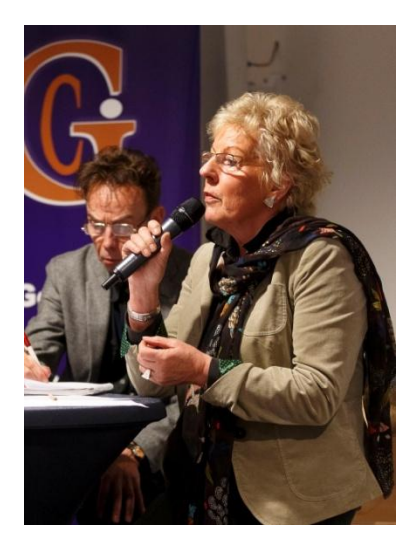
WEEK REPORT 26-29 NOV 2012